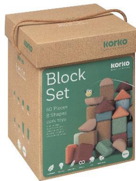
Figure 1: KORKO | 60pp set illustration.

The product is a children's toy made up of 60 cork building blocks, produced by Koriko - Made By Nature, Lda. in Portugal (Figure 1). The set of blocks come in eight shapes with ten attractive colours. The natural properties of cork make them lightweight and their texture is soft. KORKO toy weaves the link between children and nature, in a fun and intuitive way.