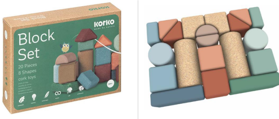
Figure 1: KORKO | 20pp set illustration.

The product is a children's toy made up of 20 cork building blocks, produced by Koriko - Made By Nature, Lda. in Portugal (Figure 1). The set of blocks come in eight shapes with ten attractive colours. The natural properties of cork make them lightweight and their texture is soft. KORKO toy weaves the link between children and nature, in a fun and intuitive way.