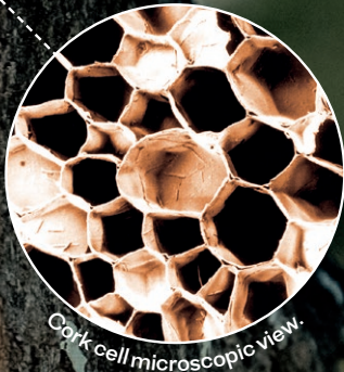
Cork cell microscopic view.

It is sustainably harvested by specialized professionals without damaging the trunk, thus enabling the tree to grow another layer of outer bark that, in time, will be re-harvested. Over the course of the cork oak tree’s life, that lasts 200 years on average, the cork may be harvested around 17 times. This means that cork is not only a natural raw material, it is also renewable and recyclable.