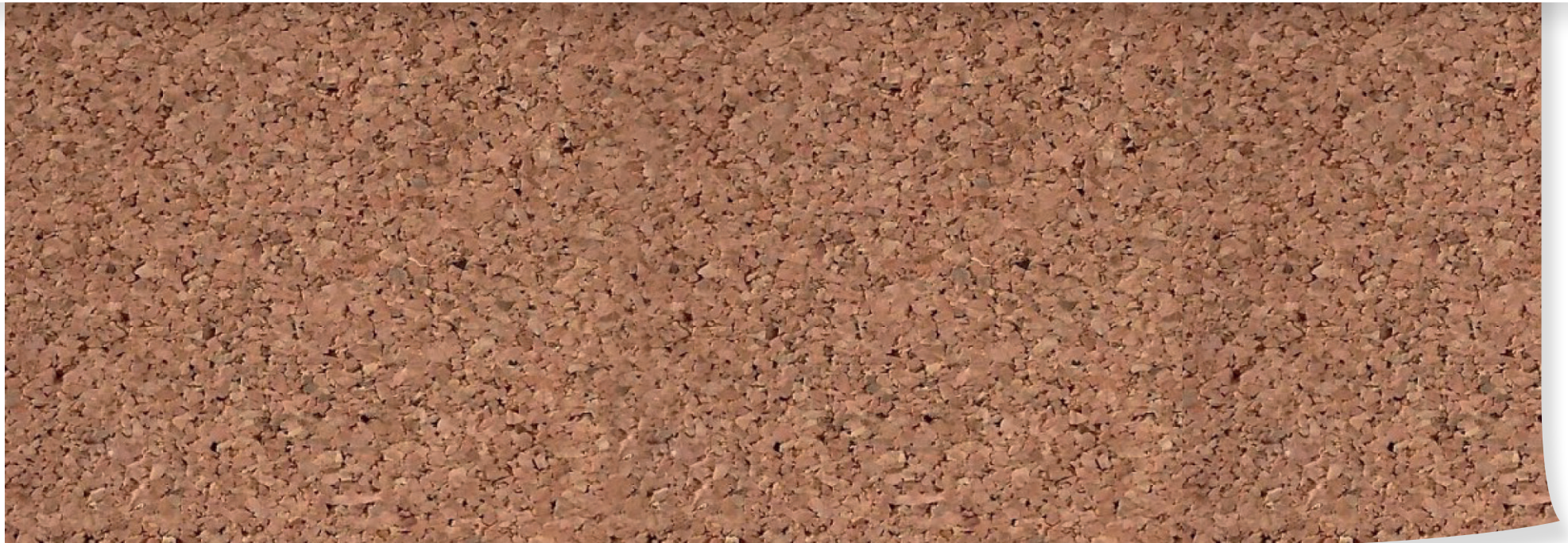
NRT 45 pre-attached underlayment with kraft paper carrier laminated with 0,9 mm thickness. In this case, the tensile strength will increase 1Mpa.